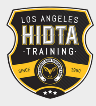
Los Angeles HIDTA

L.A. HIDTA 5801 E Slauson Ave Commerce, CA 90040