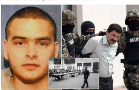
Share or comment on this article:

"Nationally recognized by ABC News, Reuters International & the Wall Street Journal and others."